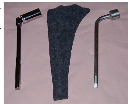
The socket & breaker bar (left) are the same overall length as the Mazda supplied lug wrench (right). Both fit the bag (center), but the socket is a much better tool when you have to remove a wheel on the road.