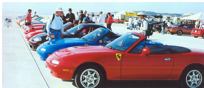
Right— For the fourth year, the San Diego Miata Club presence in the Car Club Corral was unrivaled.