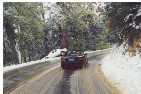
Above— Sometimes the scenery is rather interesting if you go slowly enough to see it.