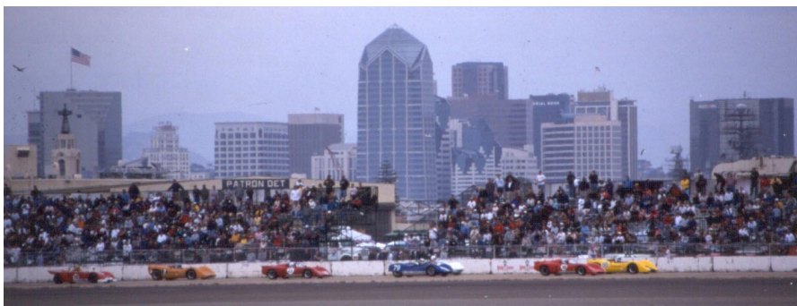
An unusually gloomy San Diego skyline presides over the start of the group 6 race.