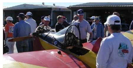
Once everyone was parked on the flight line, there were some aircraft to be inspected. Oh, and some pretty tasty tacos were cooked up just for the occasion by the EAA members.