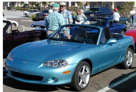
The striking 2001 Crystal Blues are starting to make their presence known at club runs.