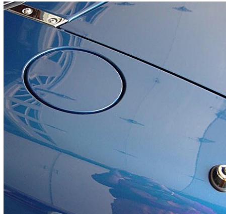
The stock fuel door is just fine, if you want it to disappear into the rear quarter panel.