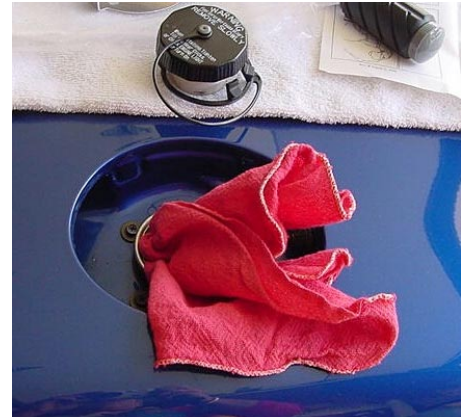
Remove the filler cap and retainer. Place a rag in the spout to prevent fuel vapors from escaping. Remove the three screws around the fuel filler neck.