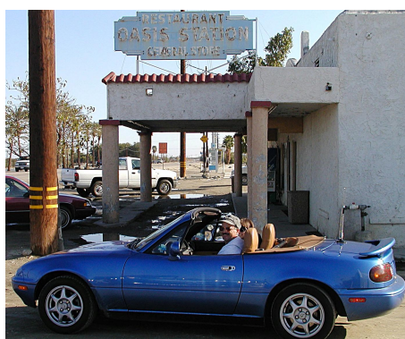
The Miatas are just as good, if not better, looking than before. Oasis Station, however, is not weathering the years quite as well.