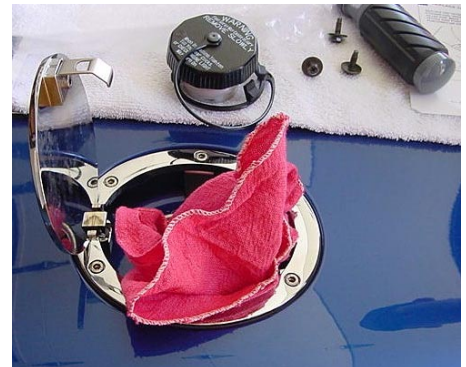
Place the new fuel door, install the three screws. Remove rag, install filler cap and retainer.