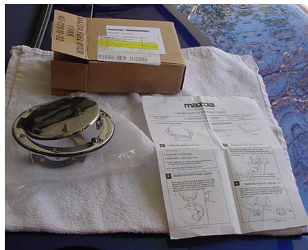
The fuel door and simple instructions come in the box from Mazda. As with all Mazda options, there is a 12 month limited warranty.

To get one of these fine looking fuel doors, at a great price, you will need to get the money to Elliot Shev before February, 22.