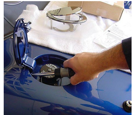
Remove two screws that hold the fuel door to the body.

$75 plus tax ($81) will have your M2 Miata looking sharp.