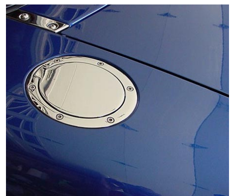
Now that is a nice looking fuel door!