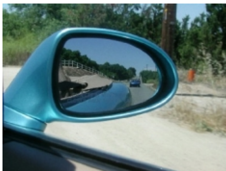
The obligatory rear-view mirror picture.