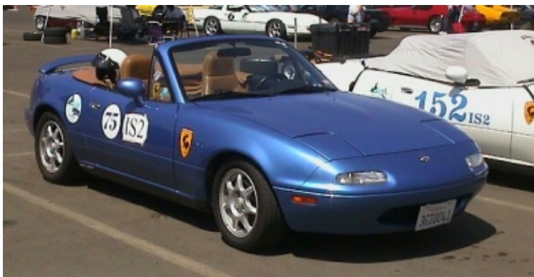
The Brokaw's rare Laguna blue and tan leather can be found at the "Q" for autocross.