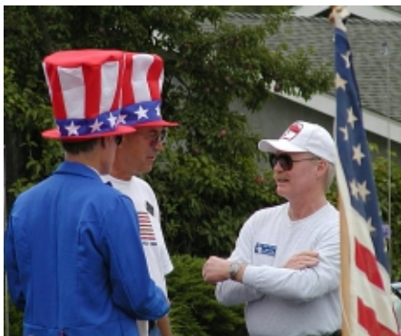
Ideas for the next Team Voodoo hats?