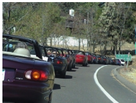
As the run proceeded inland from the coast, the gloom was replaced by warming sunshine. The twisties had something to do with lifting spirits as well.