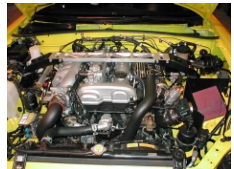
A Flyin' Miata turbocharger provides the go to complement the show of the rest of the car. An interesting design on the strut brace from Unique Metal Products.