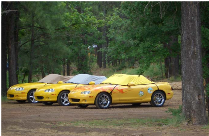
Top left— Sunshine on a gloomy day at Mormon Lake Lodge.