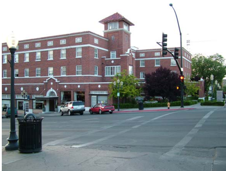
Left— Hassayampa Inn