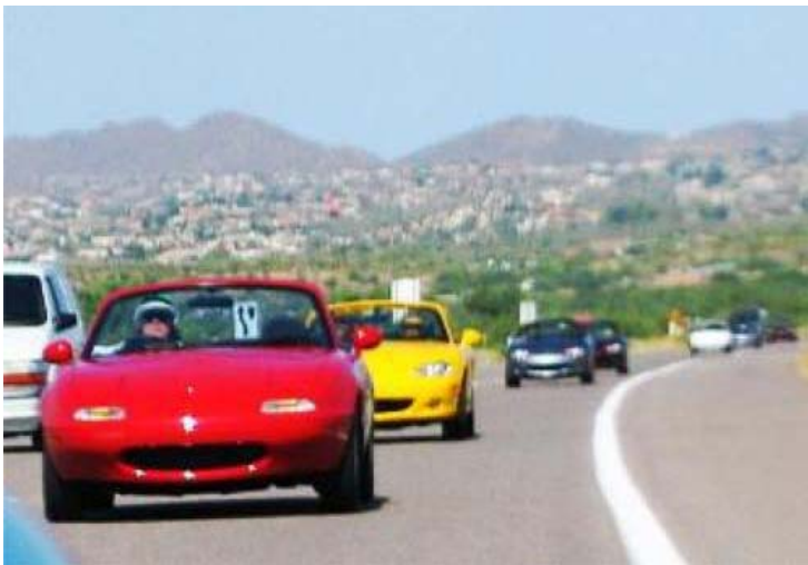
From the Hills of Phoenix to the Mountains of Prescott.