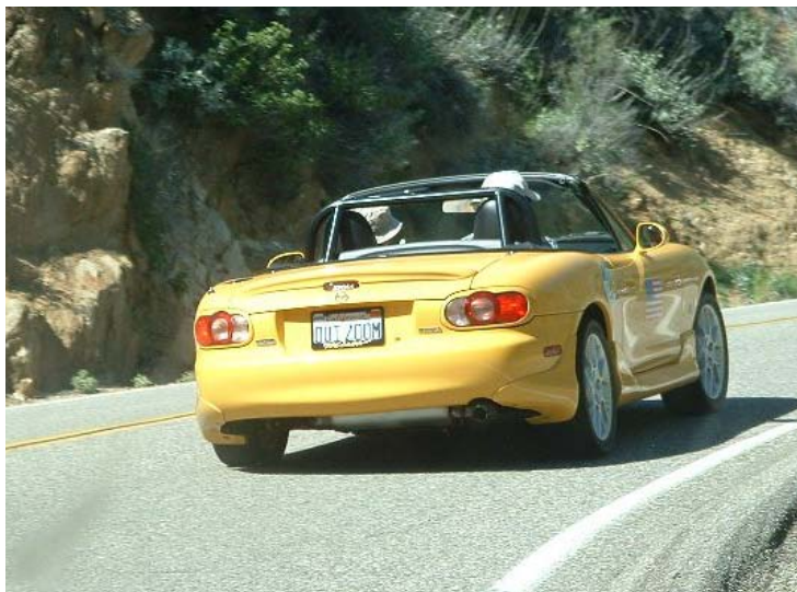
Mike Heinitz corners a cone at Autocross.

Miatas like a soft tire - 140 to 300 tire wear compound; in other words nothing over 45,000 mile tire. Dry and wet handling can usually be found in a softer compound and tire design. Do some research online or ask your fellow club members what treadwear compound they may have on their Miata. Drive carefully.