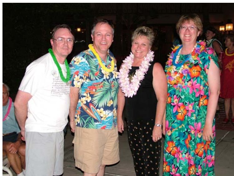
Right—Winners of the Hawaiian contests