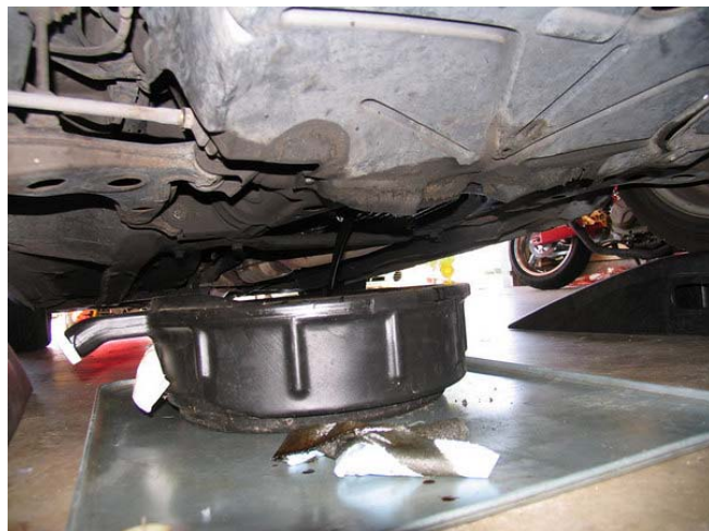
Out with the old ...

2. Place a couple of rags or paper towels beneath the filter to catch any oil that spills. Use an oil filter wrench to loosen the filter, and then spin it off. Take care not to drop it; the filter contains a good amount of