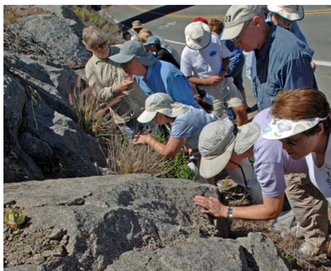
Eager rock and rollers learn to take nothing for granite.

Each stop was interesting and yet different, and our route maps gave us a brief synopsis of what we'd be learning from Monte along the way. For example, this is what was to be discussed at Stop #5 at Inspiration Point: "(Elevation 4,600') This is a great view of Banner Grade (Stop #8) and the desert mountains. The closest large, active, dangerous fault EAST of San Diego, the Elsinore