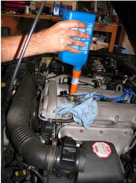
... and in with the new.

5. Start the car and check for leaks at the drain plug and oil filter.