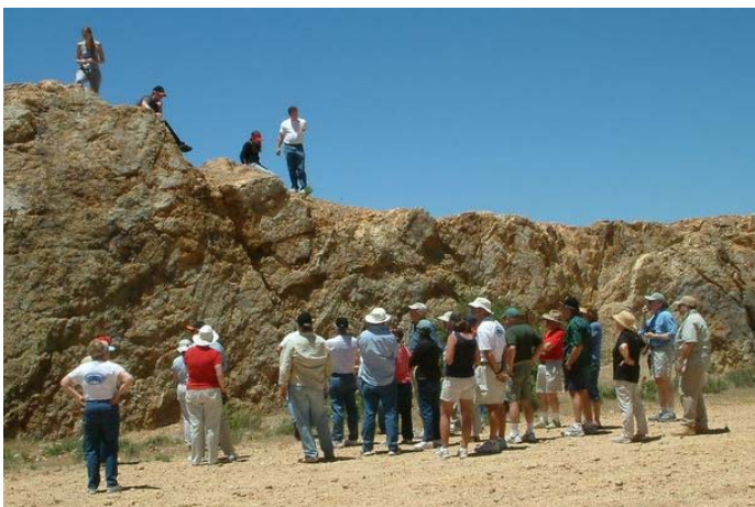
The fault rock at the Laguna Mountain shear formed at the edge a plate.