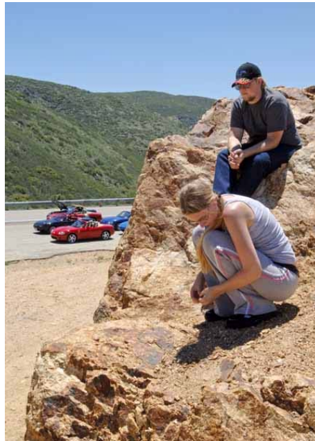
Life on the edge—not for the faint of heart.