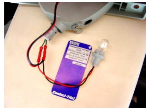
Figure 2. Spliced wires.

6. To make this a really cool installation, you could add the flasher kit that our Regalia team sells, or