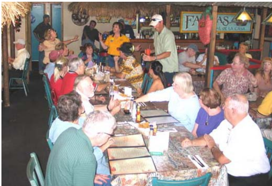
Lunch at the Nuevo Grill in Ramona satisfied appetites while bringing back more memories.