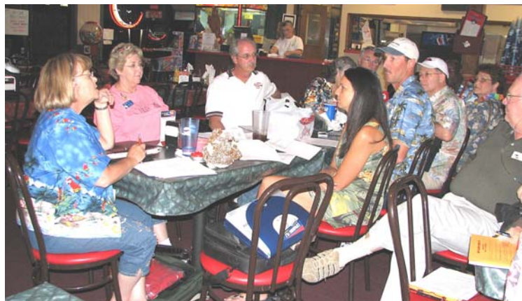
An attentive crowd was on hand for the Executive Board's first open meeting in recent memory.

To view the official minutes of this meeting, log onto Yahoo Groups and enter the SDMC-List group. Navigate from "Files," to "Minutes," and on to "2006 Monthly Minutes," then look for "SDMC Exec Board Minutes Oct 2006.doc."