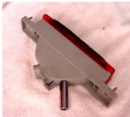
Figure 1. Socket protruding from new hole.

4. Drill, Dremel, or carve a hole the size of the smallest diameter of the new bulb socket, just past the heat sink (Figure 1). I Dremeled a hole the size of an 11 mm socket,