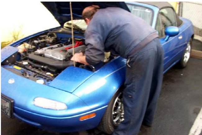
ANOTHER SIDE OF ROCKY. Here's a view many SDMC members often see.

Jackson header, a RoadsterSport exhaust, a custom-built aftermarket air intake, Racing Beat sway bars, KYB shocks, Eibach springs, Toyo