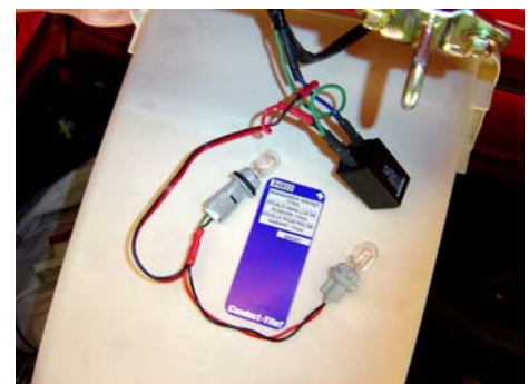
Figure 3. Flasher kit.

7. Place the light assembly back into the trunk lid, and reinstall the two 10 mm nuts.