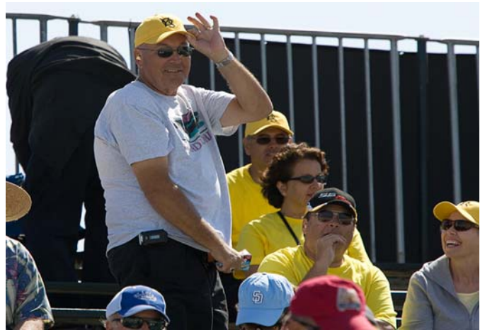
Having a good time?

For SDMC it was also the 11 th year that we have attended the "Race on the Base", although for us it began in fog early on Saturday, September 27 th . For me, this is