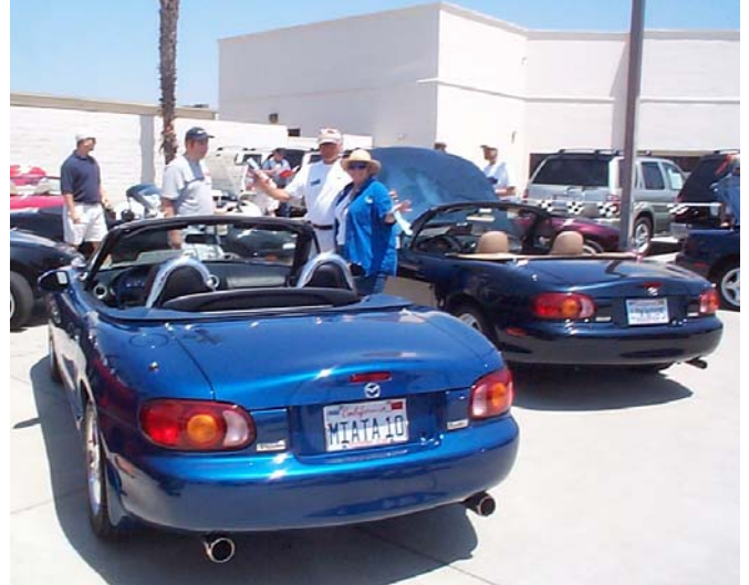
Above: Blue comes in many varieties—what's your favorite? Below: the yellows make a serious statement.

OTHERS: We have people driving orange, purple, tan cars; who knows maybe there's even pink Miata or two out there. No matter, it's all good. Whatever color the car you drive, it's what you like that's important. No color is better than any other no matter what some certain yellow car people may tell you. Viva la difference! Its part of what makes being in the San Diego Miata Club so fun and exciting!