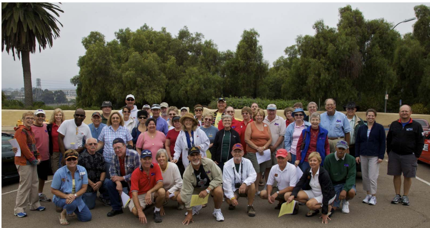
Center: The whole group stood still for about 1 minute.