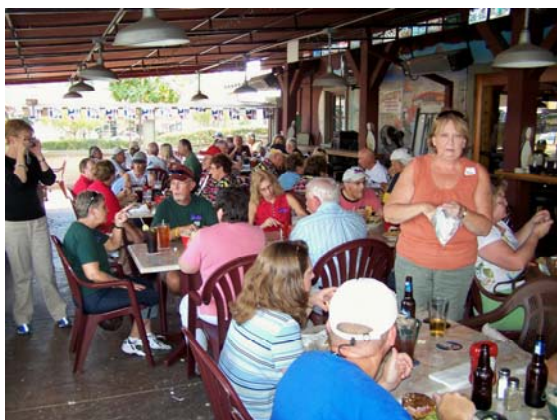
Left: Every ate their fill at Dalton's.