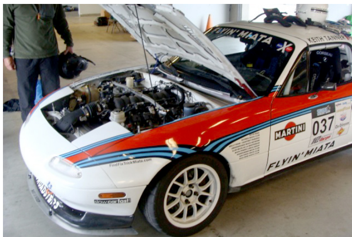
At Laguna Seca, one of Flyin' Miata's Rally Cars was on display with "San Diego Miata Club" proudly displayed.