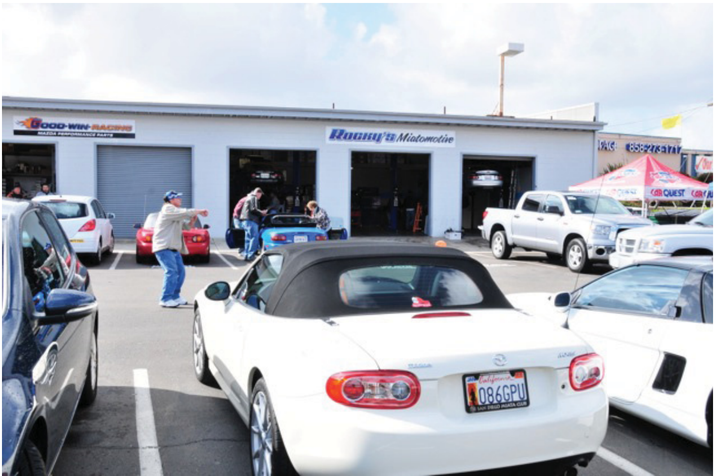
In case you have not had a chance to see it, this is Rockies new shop.