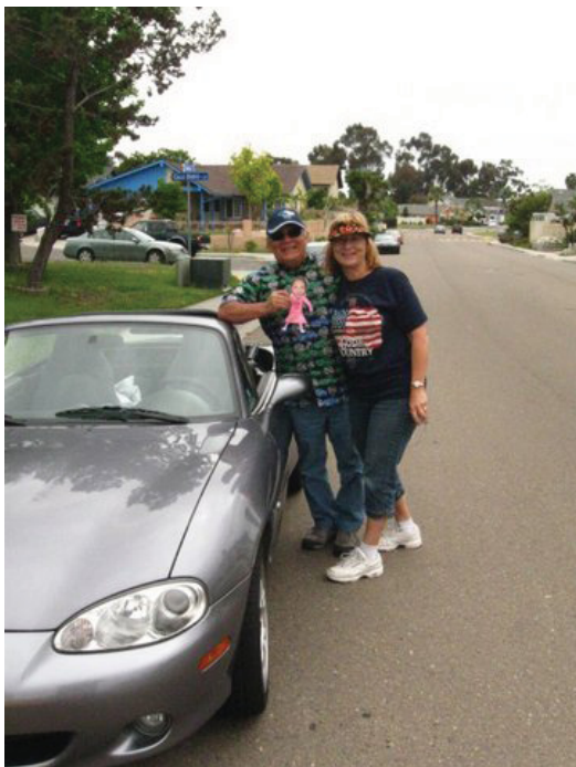
Flat doll takes a curvy road trip in a miata!