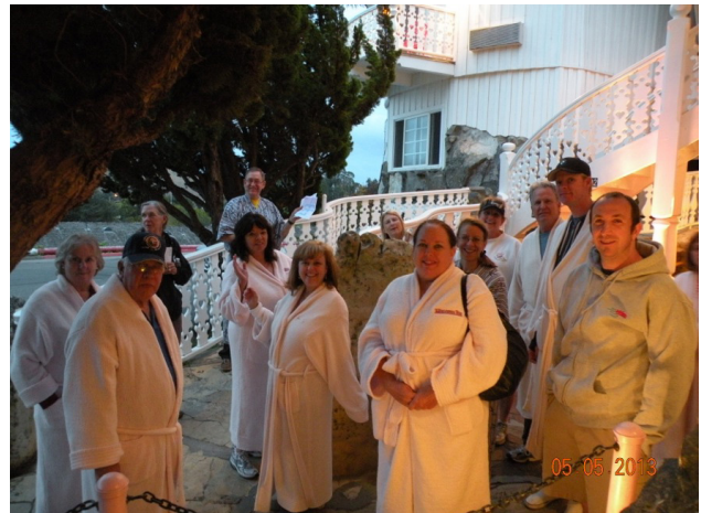
Search For Madonna