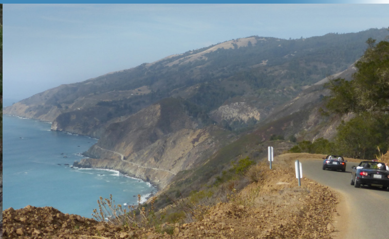
Costal Cruise