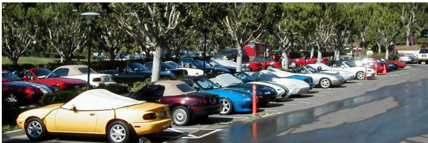
historic 1999 Safari

Stay tuned for more information about this fabulous adventure called Surf 'N' Safari. Registration will open September 15 th on our website, and hotel reservations will be available. Of course, you can always sleep at home if you live nearby, but the camaraderie and intimacy of the whole package is being on a "stay-cation" with fellow Miata friends as much as possible. We look forward to seeing you there! ●