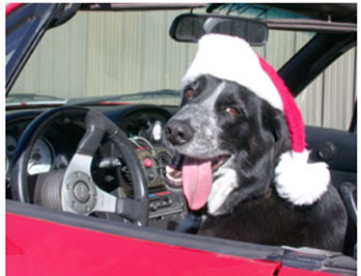
"Turbodog" Santa courtesy of Flyin' Miata, circa 2010 ●