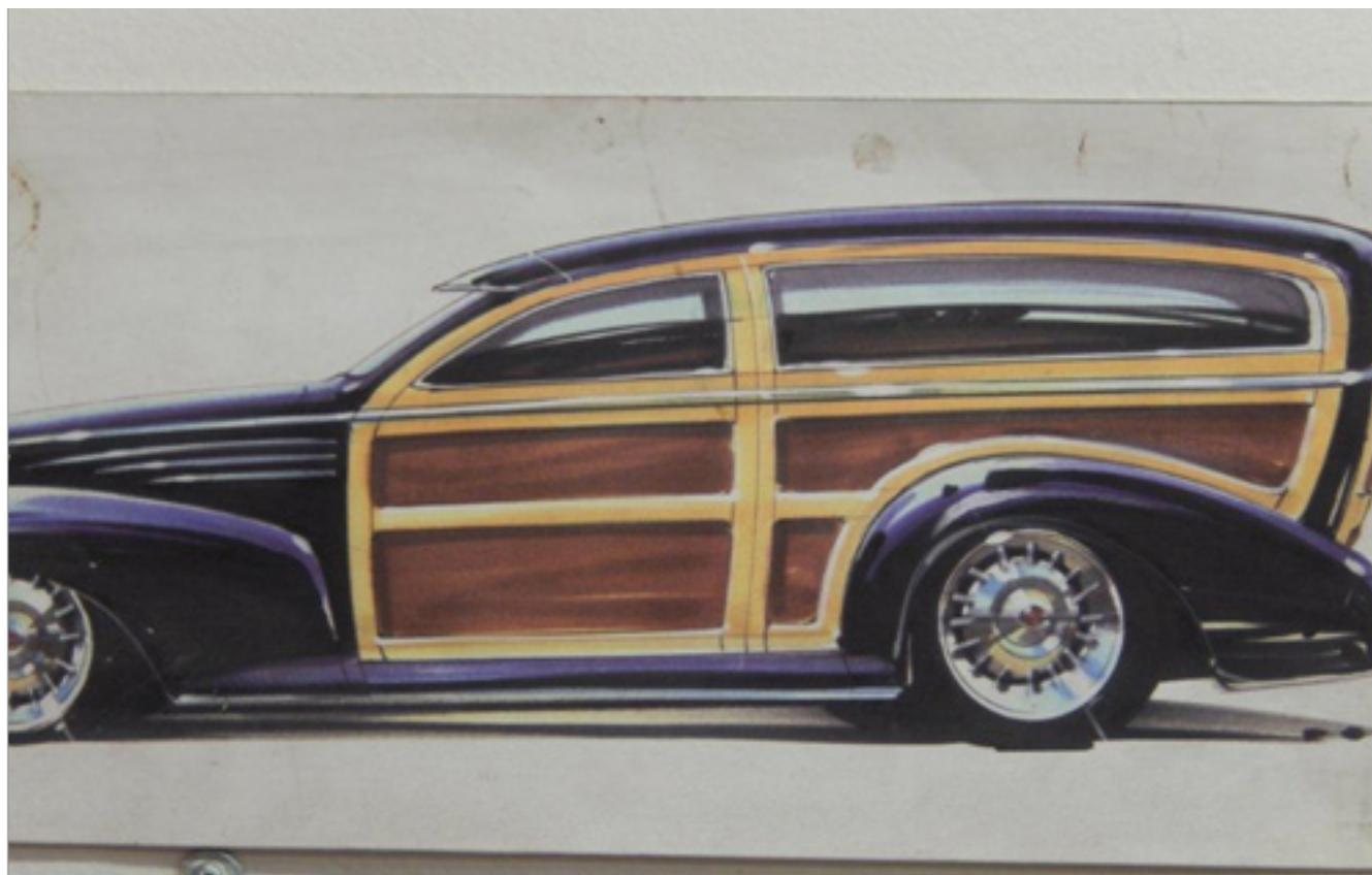
Foose's design rendering – the ultimate Woodie?