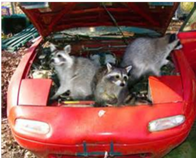
Customer to "Rocky" (wait for it) – she seems to be a little "down on power"