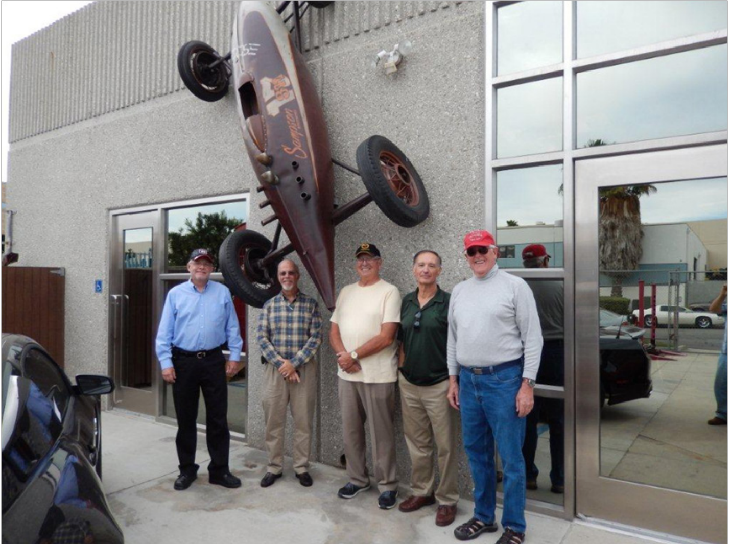
A “rogue’s gallery” of SDMCers ... my shirt selection touched-off a flurry of plaid jokes