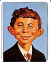
photo courtesy of the "Alfred E. Neuman for President" campaign; any resemblance to retired talk show host David Letterman is purely coincidental; timely, but coincidental.

Their marketing slogan became "you meet the nicest people on a Honda." Sales of Honda 50, 70, and 90 models burgeoned as the advertising campaign took root and public acceptance became the norm. Sales of their larger-cc ( cubic centimeters , for those of us not steeped in the metric language) motorcycles took off as well. Even other motorcycle manufacturers benefitted from the effort. The vehicles themselves became more than just transportation, they became recreation, and just plain "fun" to own and ride. One might argue that Mazda may have had a similar marketing plan for the Miata, even though I've never