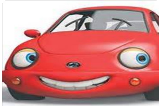
2010 marked the height of the "friendly" look, not entirely unlike the "talking" cars from Chevron's commercials.

All this to say, it seems Mazda took a page from Honda's earliest playbook. While my choice of images (above) is extreme to make the point, is there any doubt that Mazda was cultivating a friendly image with their design? Blinking our headlights (even more demonstrative with the NAs) and waving to other Miata drivers is part of the culture they wrought. IMLTHO (translated: "in my less-than-humble opinion"), the new ND seems the greatest departure from that image. Its styling is purposely aggressive from its jungle cat-like headlamp shapes, to its tightly-wrapped outer skin. Mazda's design team describes the new look as "organic." I agree, but would add "from the animal kingdom." It immediately struck me as a smaller-scale Jaguar F-type; at a price more friendly to your wallet in the process.