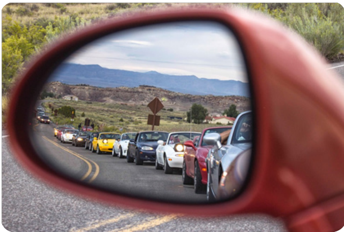
Summer Camp, entering Colorado Nat'l Monument