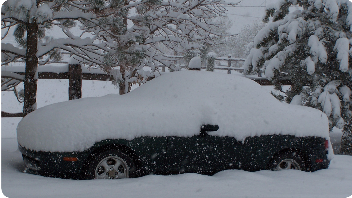
Photo NOT taken in San Diego

stretch for many of us to consider fellow SDMC members “extended family.” Our concession to holiday gift-giving? Even if you haven’t been part of it, you’ve likely heard of the holiday gift exchange and thievery.