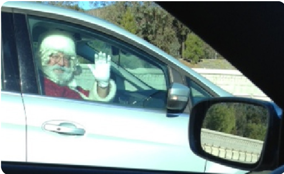
Northbound I-15 Christmas morning, courtesy of Bonnie's iPhone

Wally looked down at where his arm used to be and began wailing loudly once again, "Ohhhh myyy gaawd, my Rolllllleeeexxx is gone!"