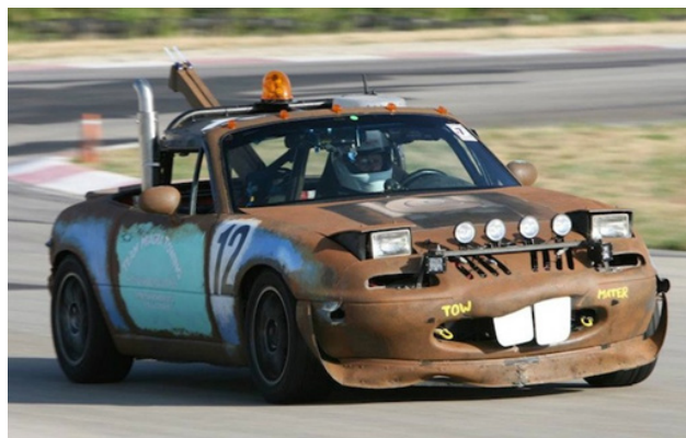
Sorely in need of Thompson Automotive's disappearing license plate bracket

Stay sharp, stay engaged ... stay attractive, San Diego Mata Club! ■