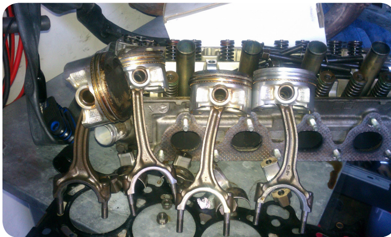
Illustration of connecting rod damage

Working for a major auto insurance carrier, I've had plenty of exposure to this type of vehicle damage. The best general advice I can offer is "avoid driving into flooded areas, intersections or otherwise." Many vehicles draw their air (for the air/fuel mixture entering the air cleaner, intake manifold, and cylinders) through inlets and ducts sitting lower in the engine compartment than they should for even minor flooding conditions. Driving through such areas and drawing water into your engine has dramatic effects on engine internals, especially piston connecting rods.