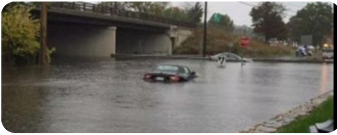
Miatas are not to be confused with Amphibians

Working for a major auto insurance carrier, I've had plenty of exposure to this type of vehicle damage. The best general advice I can offer is "avoid driving into flooded areas, intersections or otherwise." Many vehicles draw their air (for the air/fuel mixture entering the air cleaner, intake manifold, and cylinders) through inlets and ducts sitting lower in the engine compartment than they should for even minor flooding conditions. Driving through such areas and drawing water into your engine has dramatic effects on engine internals, especially piston connecting rods.