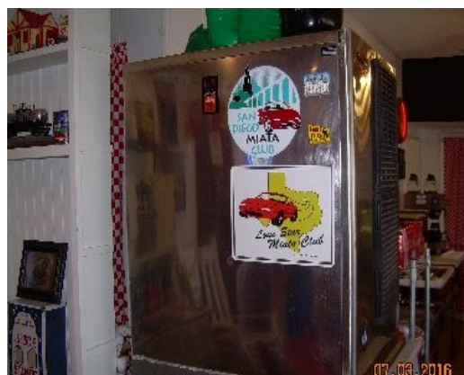
The Lone Star Miata Club magnetic below ours - "everything's bigger in Texas ..."