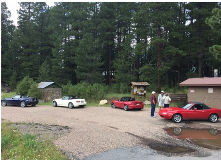
The edge of a meadow just south of Alpine, AZ

counts, I walked the 1500 hundred feet back to the comforts of the modern world convinced I would not have enjoyed being a driller, “powder monkey,” or mucker. Many of those miners had failed in the pursuit of their own, independent fortunes, which must have made those dangerous occupations even more punishing. The simple economics of the situation were explained – there were many men waiting in the wings if you weren’t up to the task.