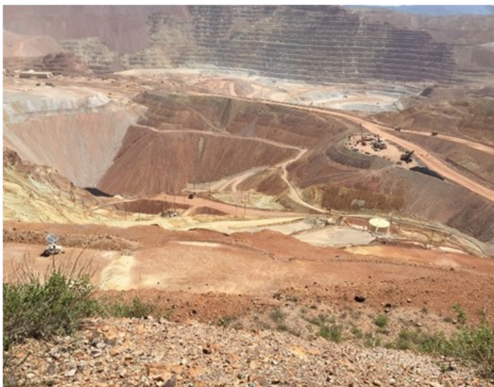
Rte. 191 ends in Morenci, with views of a huge open-pit mine.