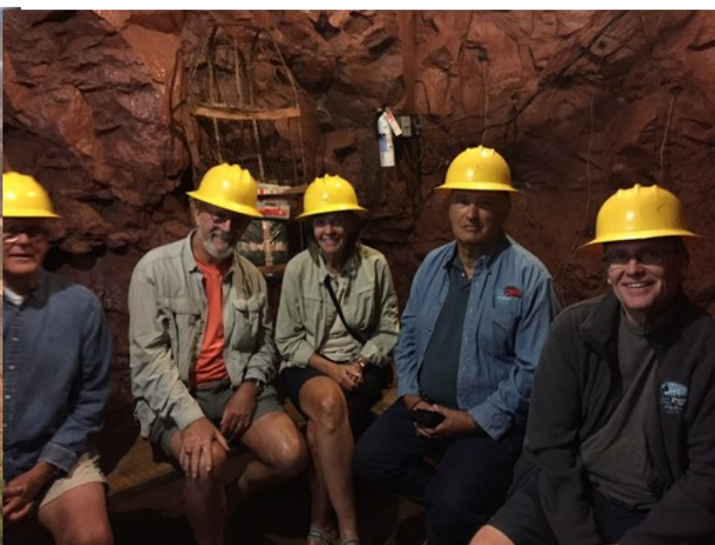
our “Motley Crue” in the belly of the mine