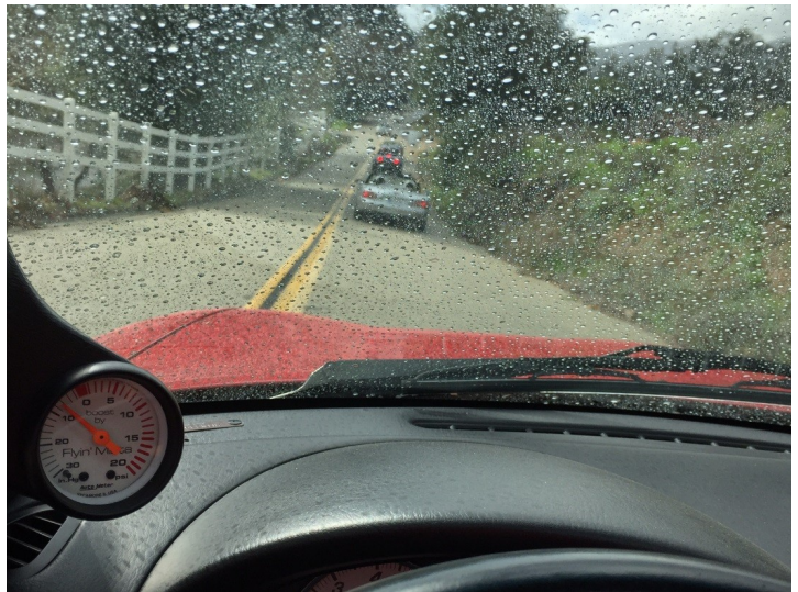
Chasing rainbows during the Uphill Downhill Run

Don't read too much into this. I have the occasional errant thought ... some worth sharing, some are not. In recognition of my third term as your president (and you thought our "railroad" system was on life support),