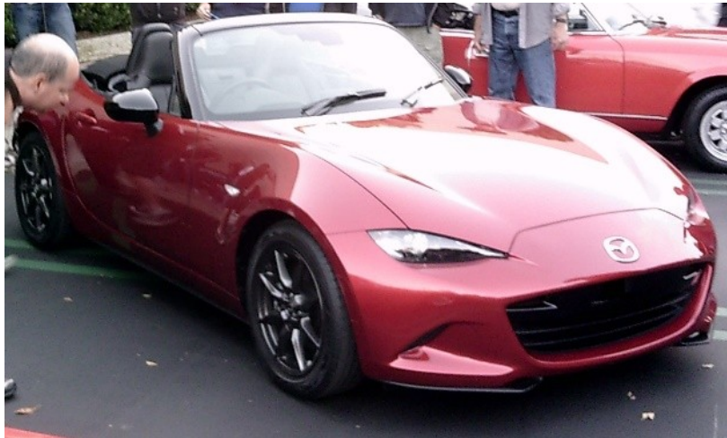
Miata ND @ "Cars & Coffee"

J ust as surely as the Vernal Equinox and Daylight Savings time announce the beginning of Spring, so too does Car Show Season. Car show is an all-inclusive term that may describe the large, manufacturer's expos like the San Diego, Los Angeles or Detroit International Shows or it may describe the very high-end shows such as the La Jolla or Pebble Beach Concours de Elegance affairs. Similarly, a car show maybe something as simple as "Cars & Coffee" drive in event.