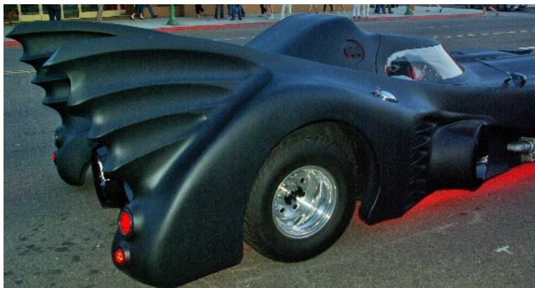
The Batmobile makes an appearance at Cruisin' Grand

Escondido has the Cruisin' Grand event that takes place every Friday evening from April through September. El Cajon has a similar event that takes place on Wednesday evening. On the first Friday of every month the San Diego Miata Club participates by cruising our Miatas down Grand Avenue in Escondido. As is usually the case with SDMC, there is always food associated with our activity.