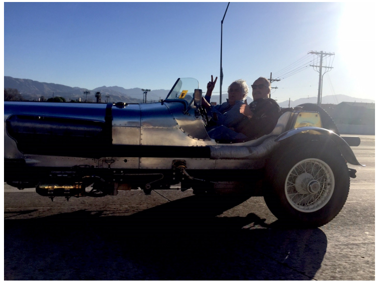
capturing Jay Leno's roadster at approx. 80 mph

During the course of my research, I realized that James Douglas Muir "Jay" Leno celebrates his 66 th birthday on April 28. Looking good, Jay! Jay's respect for the Miata, and for a legion of interesting vehicles, is certainly in keeping with our own sentiments. SDMC turned 21 on March 31 st , so we're celebrating our assault on adulthood in our April monthly meeting.