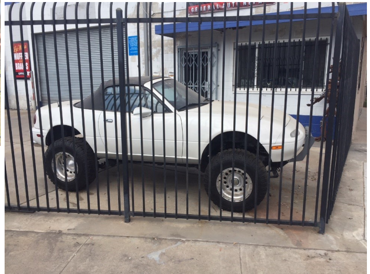
Digitally captured! This beast was spotted behind bars and within city limits.

There's something on the events calendar for most everyone; even good stories can't replace the activities themselves. Get out there, San Diego Miata Club! T&T