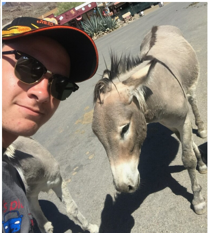
Presto and Burro

Well that ends the 2018 Adventures of Presto. Neither of us can wait for 2019. A track day with a new Flyin' Miata Turbo...oh boy. T&T