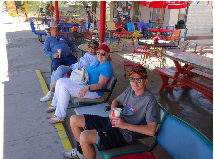
Ice Cream at the Snow Cap