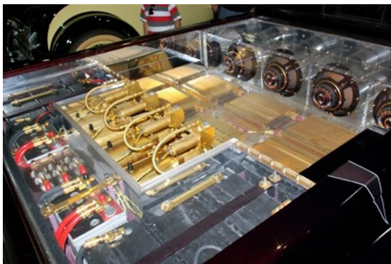
24 Karat Gold Sound & hydraulics

There are also several celebrity cars in the collection. Boxing champion Oscar De La Hoya (aka "The Golden Boy") commissioned a low rider pickup truck after winning the Gold Medal at the 1992 Olympics. His truck is finished with 24 karat gold fixtures including the sound system and the hydraulics located in the bed of the truck.