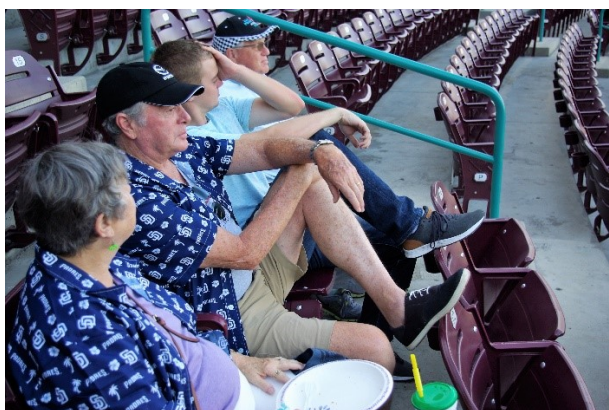
San Diego Miata Club Members enjoying baseball, snacks and liquid refreshments.

The Storm acknowledged us on the scoreboard and even eked out a 1-0 win over the