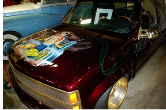
Oscar De La Hoya "Golden Boy" Truck

One other celebrity vehicle at the museum is a beautiful yellow Ferrari that Sonny Bono gifted to Cher in a futile attempt to win back her affections from Gregg Allman. We know it was futile because Marconi, and not Cher, now has the Ferrari.