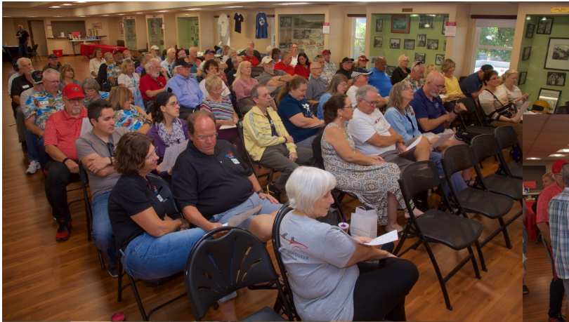
Regalia table below