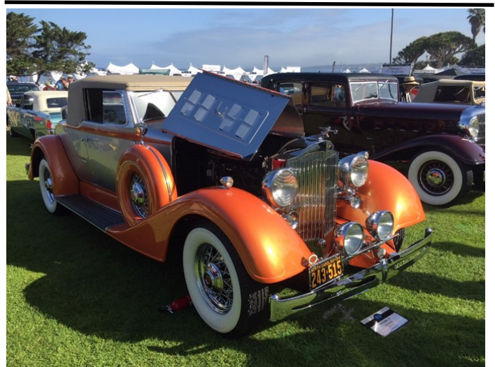
A SPY PHOTO: