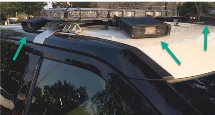
Here's an image of the ALPR hardware in question.

Are there offsetting personal privacy issues and threats to citizens' liberty? Certainly; but that isn't anything I'm going to thoroughly vet in the space of this column. There's a healthier discussion and debate available at this internet site: https://www.eff.org/pages/automated-license-plate-readers-alpr . Even ordinary citizens such as you and I can download a software app (Airbag Recall app.) that allows us to scan the license plate of any subject vehicle, and look up the VIN to determine if the vehicle is affected by any manufacturer recalls. We might ask ourselves, "How much longer will it be before we can access more personal information in this manner."