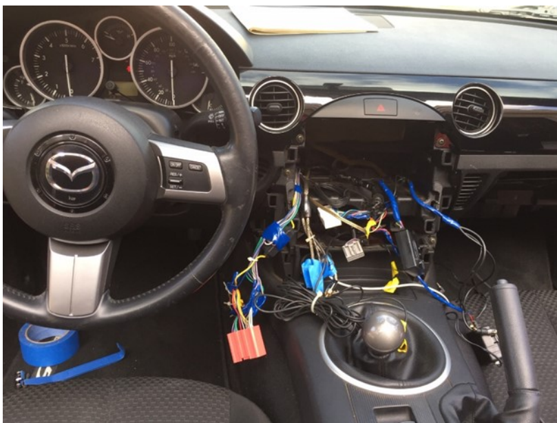
Uh-oh! There was also an amplifier and Sirius hardware buried in this "cave."