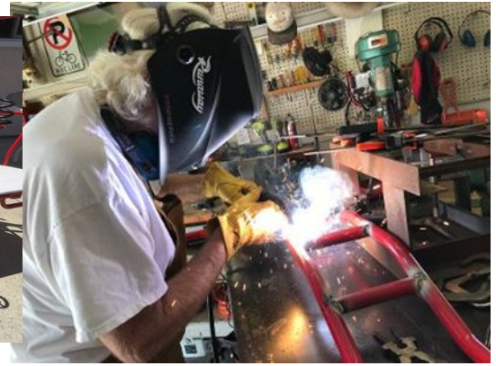
Multiple chairs are part of the “Kesler Collection” Believe it or not, this piece is a functional glider