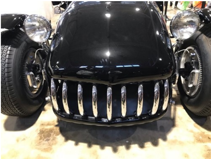
A 1953 Kurtiss roadster sports a toothy grin